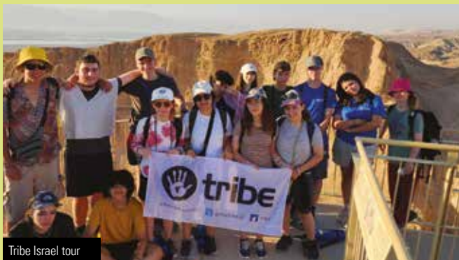
Tribe Israel tour

Above all, there is a determination and responsibility to create an experience that will bring hope and healing to our nation, connect youth to their local shul communities, and enrich the confidence and energy of everyone involved to become thoughtful human beings and proud Jews. To achieve that, we might just have to take off our shoes. It is summertime after all!