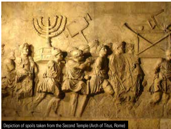
Depiction of spoils taken from the Second Temple (Arch of Titus, Rome)

The Fast of Tammuz primarily commemorates the breach of the walls of Jerusalem before the destruction of the Second Temple in 70CE. It falls on the 17th day of the Hebrew month of Tammuz, unless that date falls on Shabbat when it